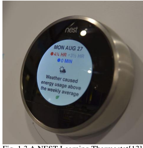
Fig. 1.3 A NEST Learning Thermostat[13]

Home automation has been around for decades now, but due to recent developments in IoT it can be made available to a larger part of the population.