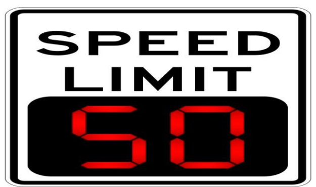
Fig. 1.4 A variable speed limit sign[13]

Implementing sensor based smart traffic control can help resolve traffic issues. Smart parking, electronic toll collection systems, logistic and fleet management, vehicle control, and safety and road assistance all use similar data.[11]